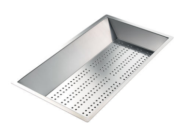
Stainless steel perforated tray 8151 000 * only in combination with the accessory 8644 101

8159 101 * only in combination with the accessory 8644 101