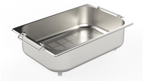
Stainless steel colander 8154 000