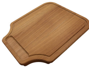
Iroko-wood chopping board 8647 000