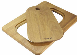
Iroko-wood sliding chopping board 8644 041