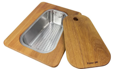
Iroko-wood chopping board with stainless steel colander 8644 042